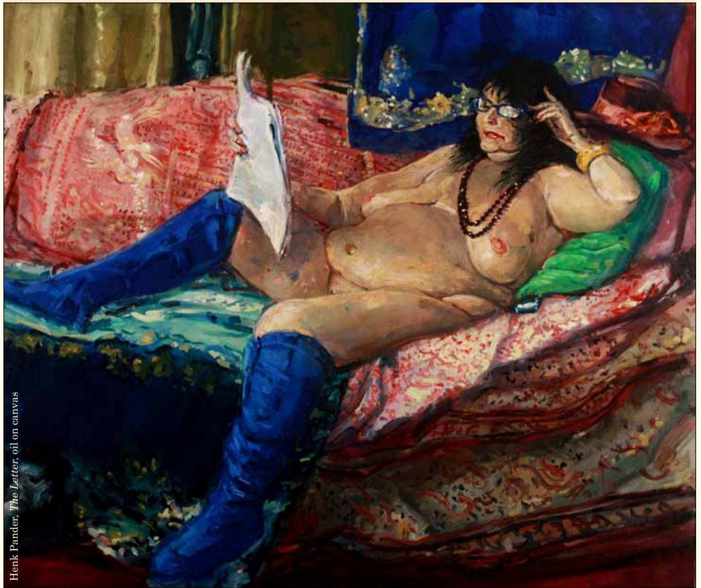
Henk Pander, The Letter , oil on canvas